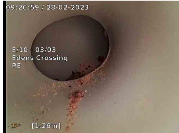
E_10 - 03_03_184c275d-668a-4d9a-8bf3-c97ffd64c0a2_20230228_112625_881.jpg, 00:00:18, 1.26 General comment / Propert connection into main (road crossing) sewer