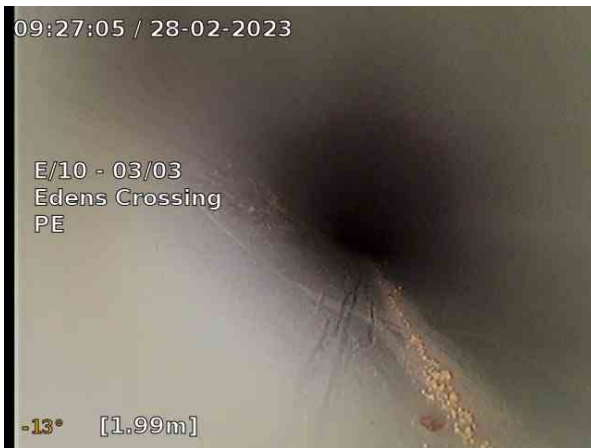
E_10 - 03_03_5894c395-5e31-4293-bf9f-453be1b52057_20230228_112743_724.jpg, 00:00:24, 1.99 General comment / Camera in sewer main 160 PE