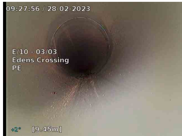
E_10 - 03_03_c5f9586e-faaf-49fb-bd5a-ce93fd48b1e9_20230228_112816_222.jpg, 00:01:15, 9.45 General photograph, the camera is pointing in the direction of travel (forward)