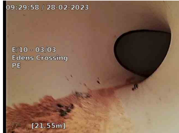
E_10 - 03_03_98be17d0-0323-4b96-9369-f097f5a38149_20230228_ 112905_846.jpg, 00:02:57, 20.82 General photograph, the camera is pointing in the direction of travel (forward)