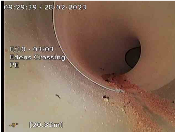
E_10 - 03_03_4b9131c8-c9bf-452a-9f94-1cb7b09bc443_20230228_1 12852_156.jpg, 00:02:57, 20.82 General photograph, the camera is pointing in the direction of travel (forward)