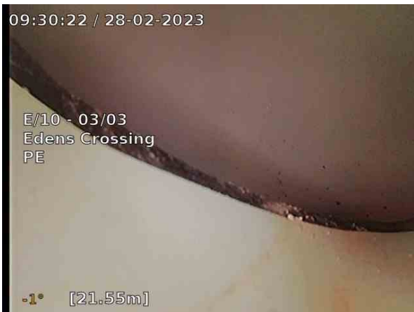
E_10 - 03_03_d220e86e-f97e-4674-b04a-ddf97f95c25e_20230228_1 12926_195.jpg, 00:03:41, 21.55 Finish node, junction or connection with another conduit, Nodename:, 03/03