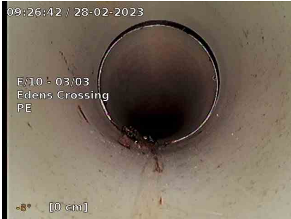
E_10 - 03_03_7714770a-db32-4088-ac52-6f4dbb54cfa6_20230228_112533_593.jpg, 00:00:00, 0.00 Start node, inspection opening, Nodename:, E/10